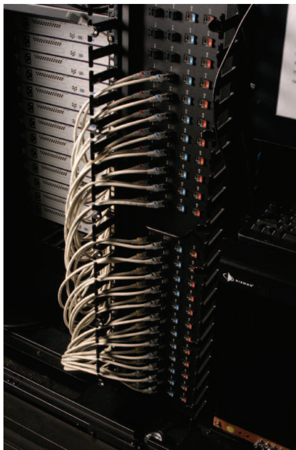
VersaPOD Zero-U Vertical Patch Panel

When evaluating outsourced space security is a prime consideration. Security should include biometrics, escorted access, after hours access, concrete barriers, and video surveillance at a minimum. Some spaces utilize cages to section off equipment with each tenant having the ability to access only their cage. However, should multiple tenants occupy the same floor; it may be possible to access another tenant's equipment either under the raised floor or over the top of the cage. This may make the space undesirable if personal/confidential information is stored on the servers housed within the cages. Escorted access for service personnel and company employees provides an extra level of assurance that data will remain uncompromised in these spaces.